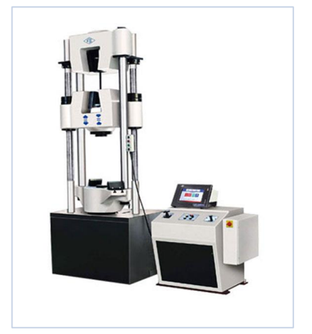
Universal Testing Machine